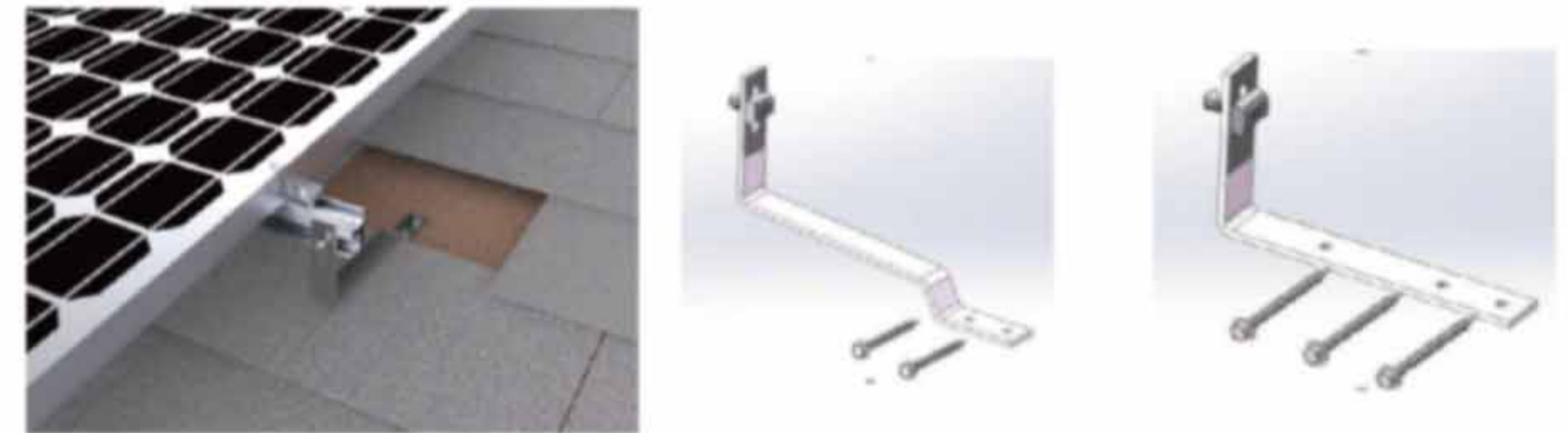
JS-R-09 -2 Slate Tile Roof Solar Mounting System